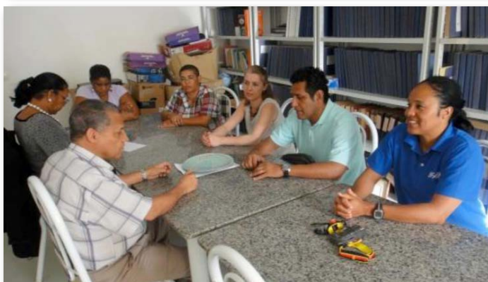
Visit of special education schools and PC and blind associations.

We had an important meeting with Minister of Education and Sports, Fernanda Marques . She appreciated the presence of IFAPA in Cape-Verde and thanked COPAC for what has been done for the development of adapted sports in the country. She also showed interest in our collaboration to maximize the participation of people with disabilities in physical activities. In the meeting with the National Director of Sports and his staff, he was very satisfied with our presence and told us that the country is deeply committed to developing adapted sports.