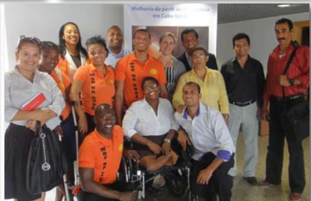
First day of visit. Conference organized by Ministry of Education and Sports and Cape-Verde Paralympic Committee.